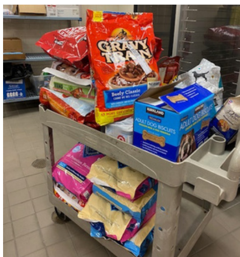
Thank you to all who continues to help feed our client's pets.