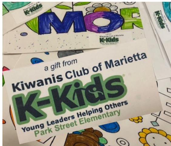
Placemats made with love for our Meals on Wheels clients.